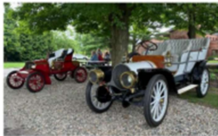
One of many pre-1916 cars on display at Celebration of Brass V in July

The Museum of the Horseless Carriage preserves this legacy.