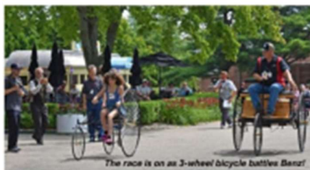
The race is on as 3-wheel bicycle battles Benz!

Celebration of Brass (our fifth!) was fantastic as were the tours that preceded it. Not often does one see such a gathering of pre-16 automobiles as what came together for this amazing event: steam cars, rides in Brass Era cars, steam and other demonstrations -- and even a little fun with the crank start challenge and an epic race between an 1885 Covington 3-wheel bicycle and the 1886 Benz patent motor wagon. We do have to report the bicycle was champion both Friday and Saturday!